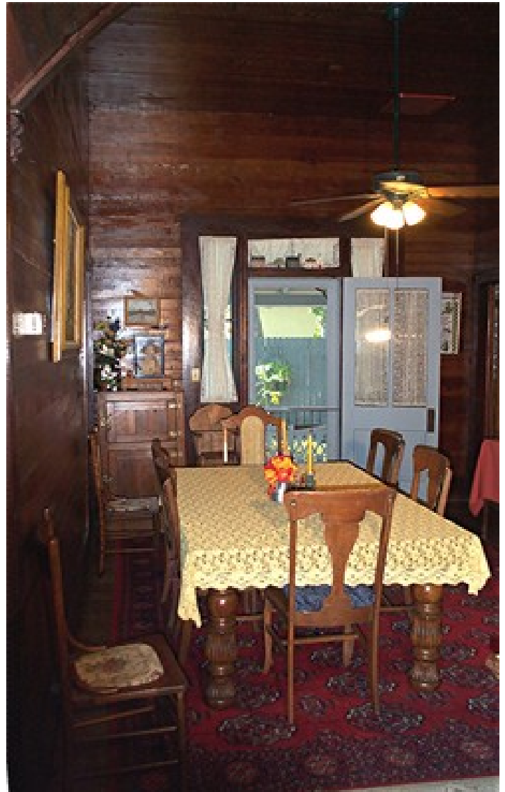
4_Dining_room_3 – Barrel Ceiling in Dining Room.