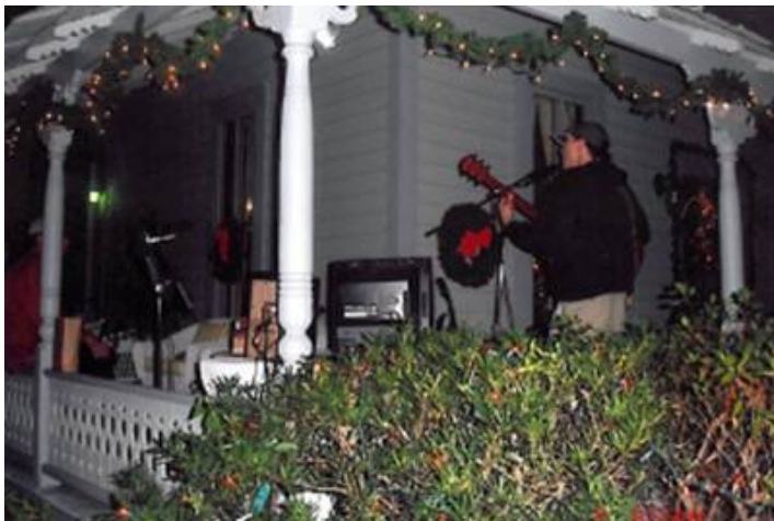
2_Figley_photo_of_elevation_3 – Fun and Entertainment are part of the plan.