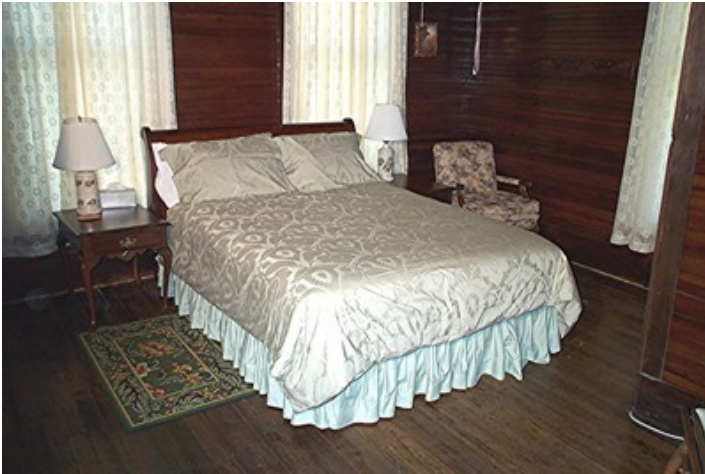
9_Victoria_Bedroom_3 – The Victoria Room.