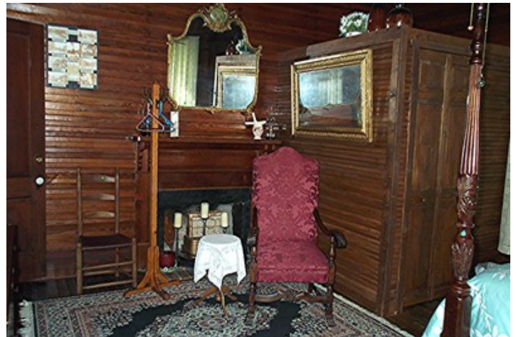
8_Magnolia_bedroom_7 – Seating area in the Magnolia Room.