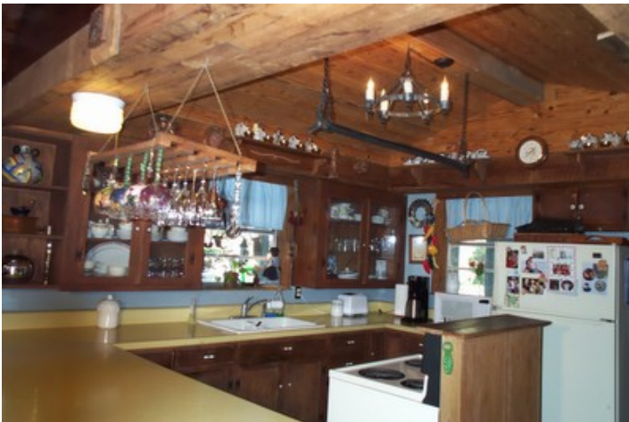
6_Kitchen_3 – Heavy timbered ceiling in kitchen.