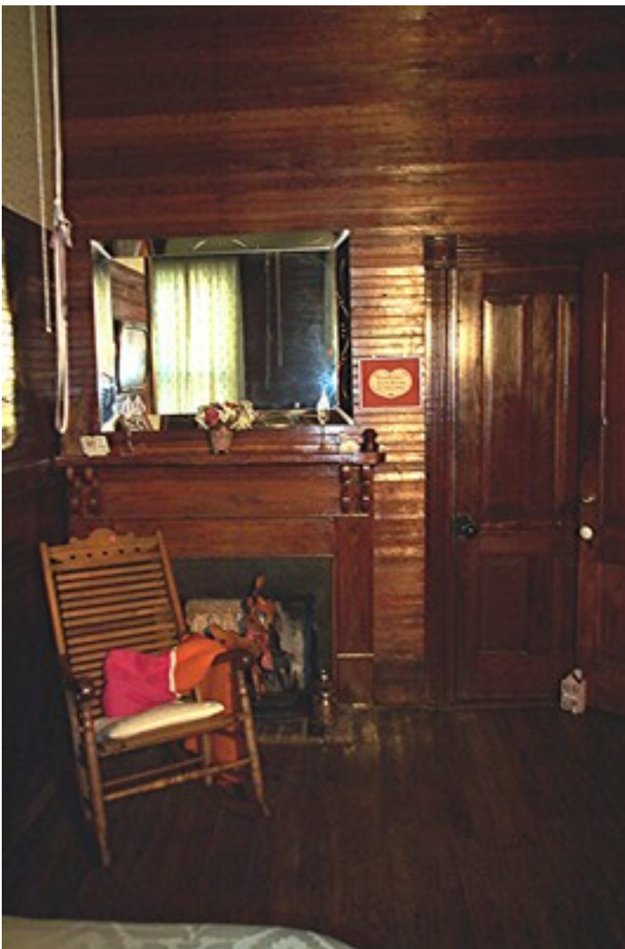
91_Victoria_Bedroom_5 – Seating area in the Victoria Room