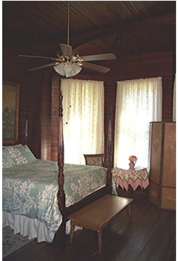
7_Magnolia_bedroom_3 – The Magnolia Room.