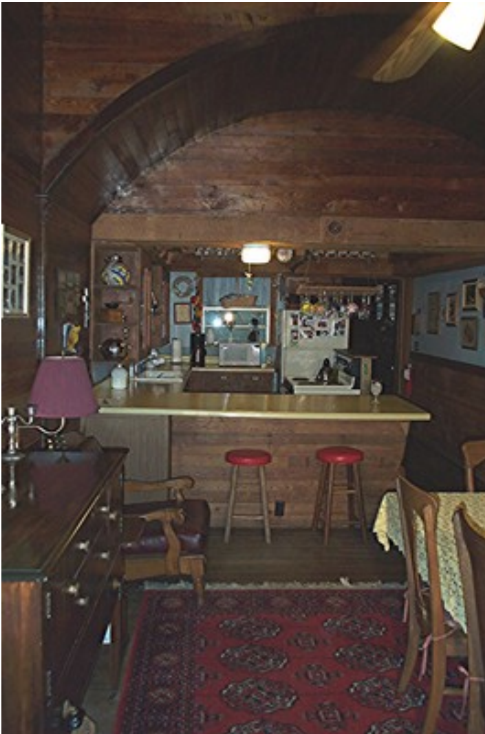
5_Kitchen_6 – Historic architectural details preserved with care.