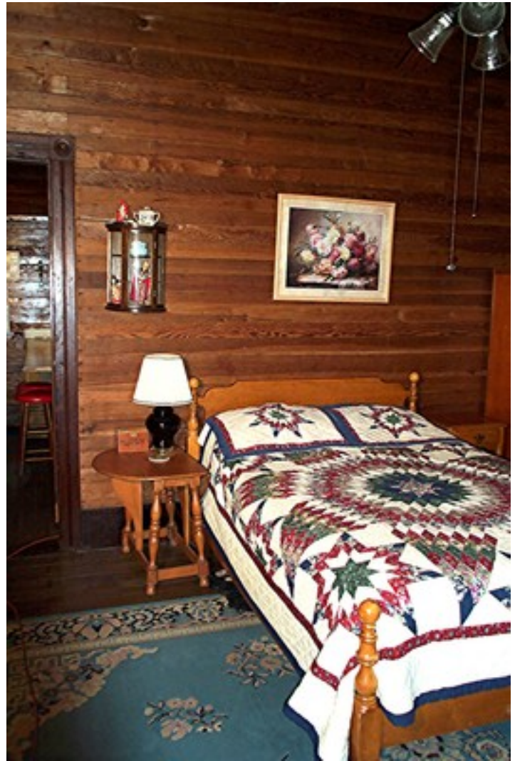
92_Keeper_bedroom_4 – The Keeper's Bedroom