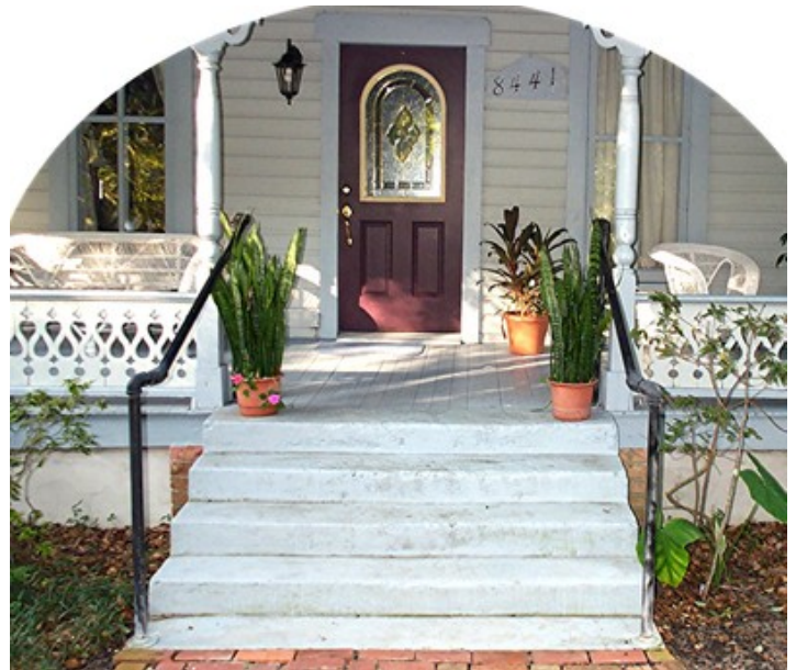
1_Lillian_Elevation_8 – Gracious entry greets all guests